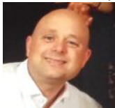
mta 7 in charge Canterbury, UK